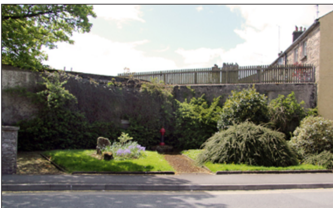
Before - The bed as it was in May 2019

A new plaque commemorating the refurbishment was also erected – leaving the old one still there. The following images will give you some idea as to the changes made. The first two images are views of the garden Before & After – the first taken in May 2019 and the second in June 2021. The other two images are just close-ups of the two beds newly refurbished.