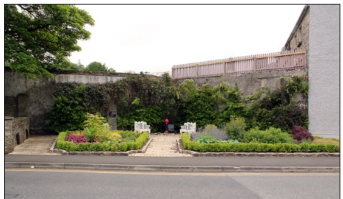
After -The bed in June 2021