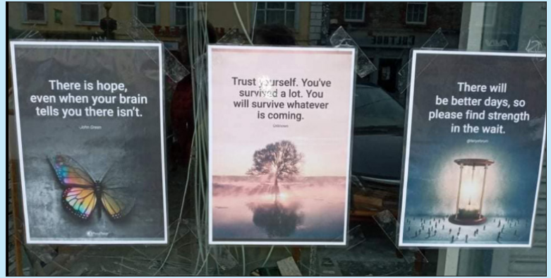
Positive thinking posters which can be seen around town.

From All here in the Semicolon Project Roscrea.