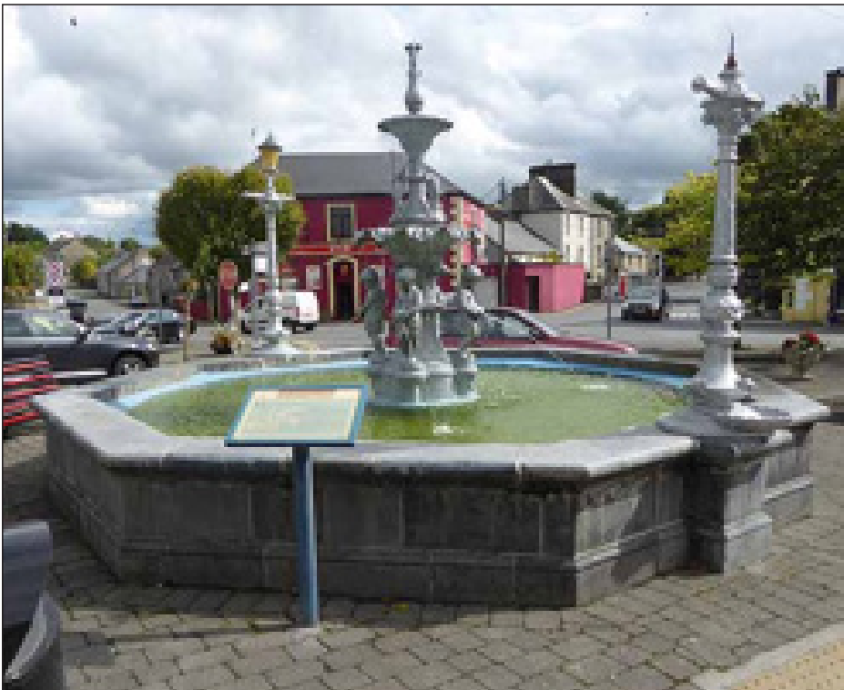
Fountain, Rosemary Square, Roscrea – A finely executed public fountain, dating from about 1860, resited in 1925, incorporating two original gas lamp standards.

Just last week, I had the opportunity to walk through part of the town and got to stop and look at the fountain in Rosemary Square. When you stop to look at it, it really is a beautiful feature (for me it is usually just one of many Roscrea landmarks). There is a little sign beside it, that tells a little about it being moved from its original location to where it is now, and there appears to be a little historical route mapped out. Just a thought, for the Summer maybe have a walk along this historical route, and visit some of the Roscrea landmarks, encouraging us to engage with the town and sites as a tourist would. We would love to see your photos and stories.