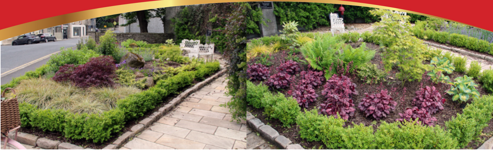
"A Little Haven at the very start of the town with pollinator-friendly planting"