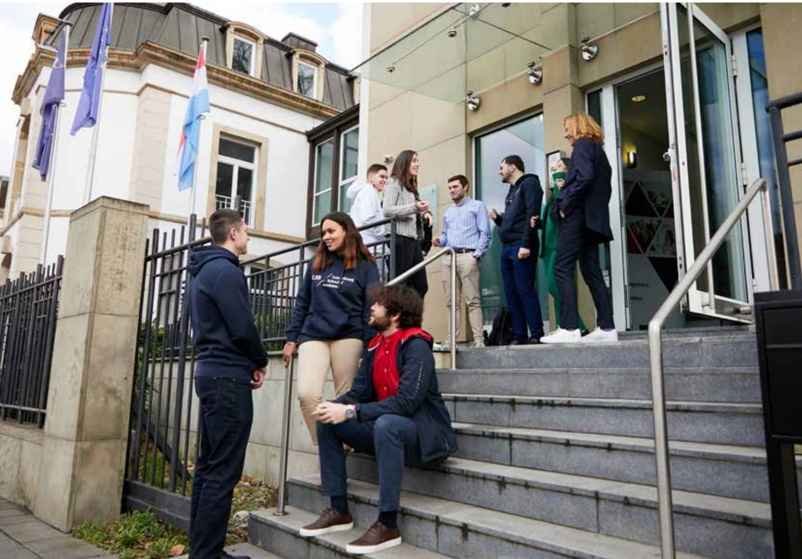
Current Campus of LSB