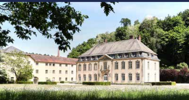
Future Campus of LSB