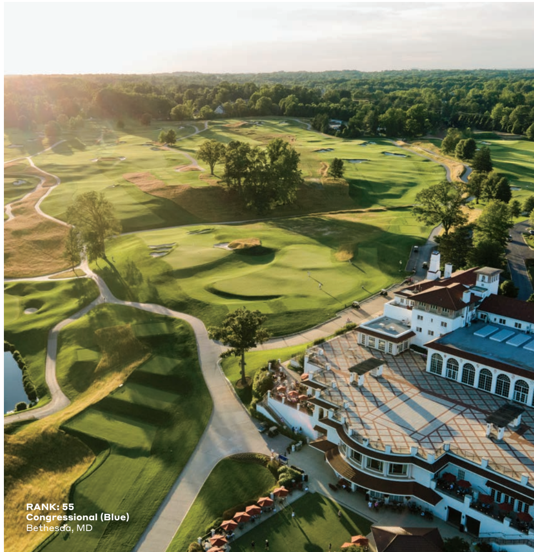
RANK: 55 Congressional (Blue) Bethesda, MD

Small-town wonders don’t stop in Nebraska. Other courses built since Sand Hills near sub-5,000-person towns include Ohoopie Match Club in Cobbtown, Ga. (No. 39), Gamble Sands outside Brewster, Wash. (No. 82) and Congaree near Ridgeland, S.C.