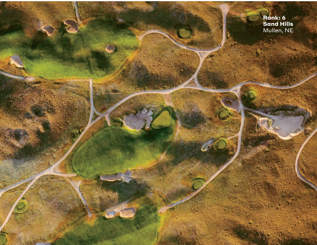
Rank: 6 Sand Hills Mullen, NE