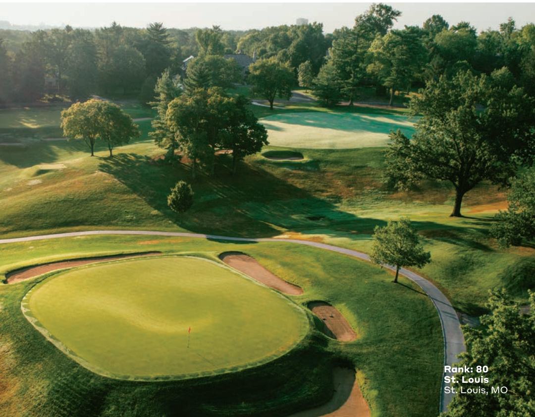
Rank: 80 St. Louis St. Louis, MO