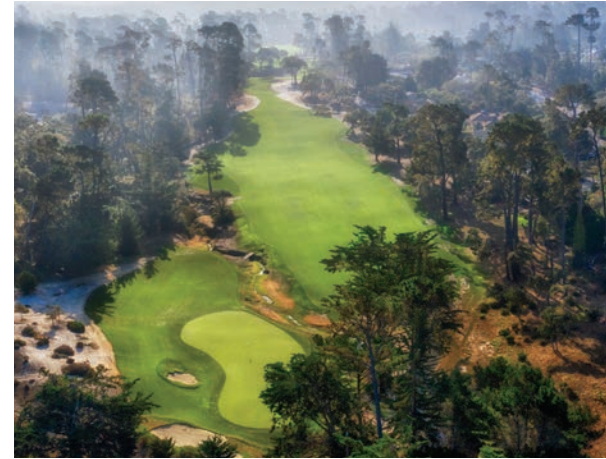
Rank: 78 Monterey Peninsula (Dunes) Pebble Beach, CA

this country as courses are made “major ready”—making them more linear by reducing playing angles, adding ill-conceived hazards and trees, detaching fairway bunkers from their fairways and pushing tees back to “Tiger” territory. In short, every design aspect of a course comes under siege.