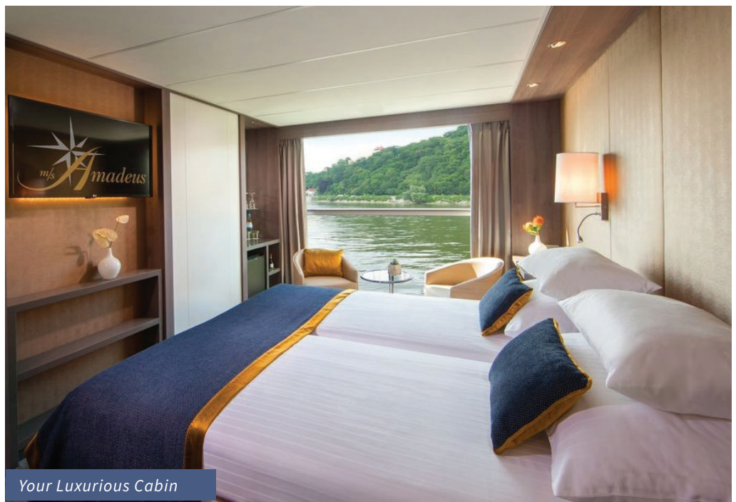
Your Luxurious Cabin

Included morning city tour of Strasbourg. This city, situated on the border of France