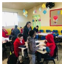
Tijuana, BC, Mexico