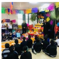
Orange County, CA