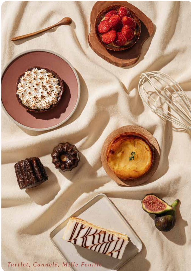
Tartlet, Cannelé, Mille Feuille