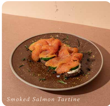
Smoked Salmon Tartine