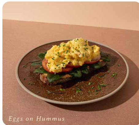
Eggs on Hummus