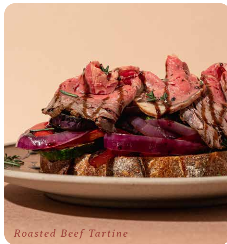
Roasted Beef Tartine