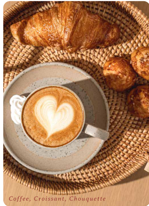
Coffee, Croissant, Chouquette