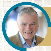
Leroy Hood, PhD CEO Phenome Health Seattle WA | USA