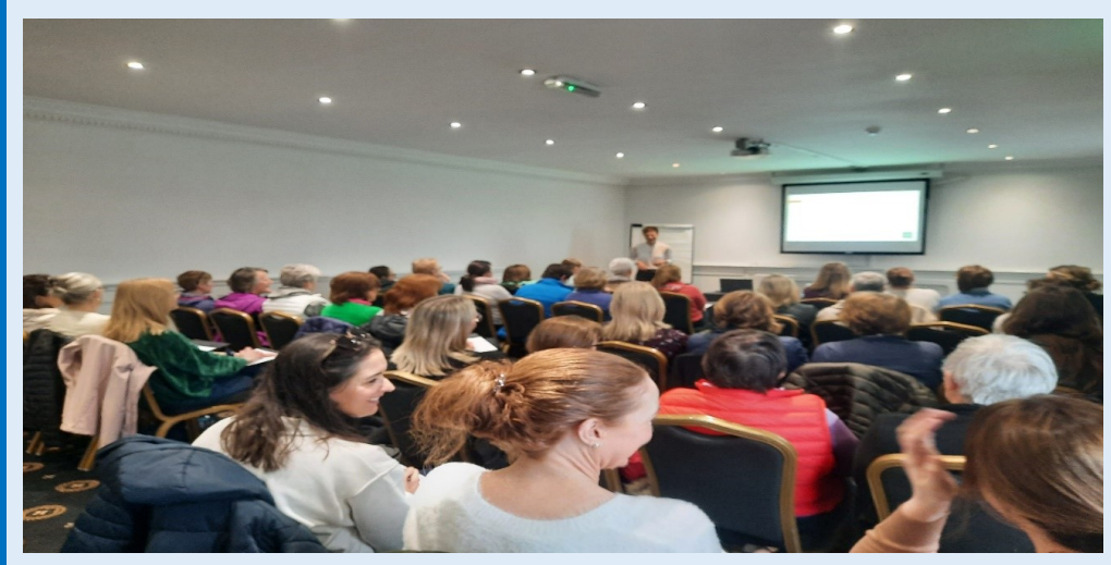
Figure 1Participants enjoying workshop on How to Train as a Midlife Woman

A workshop on How to Train as a Midlife Woman in Nenagh. This workshop provided participants with practical solutions and science based strategies for active women and to help those who wish to continue to perform as you age.