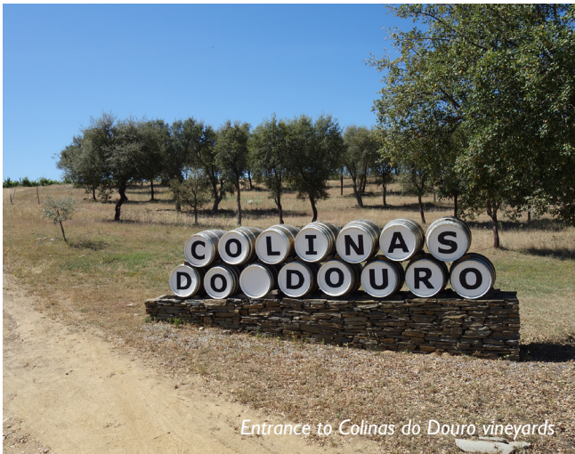
Entrance to Colinas do Douro vineyards

Situated in the far southeast of the Douro demarcated region, the vineyards of Colinas do Douro are a stone throw away from the Spanish border. This very large estate is the combination of four Quintas, providing over 476ha of largely north facing vineyards at an average 600 metres in altitude. In contrast to the picture postcard terraced slopes of the central Douro, the location is wild and rugged, as we can testify having experienced a thrilling off-road jeep ride on our tour of the estate! Intriguingly, the area also encompasses a nature reserve, playing host to bats, native small birds and the stunning endangered Egyptian vulture.