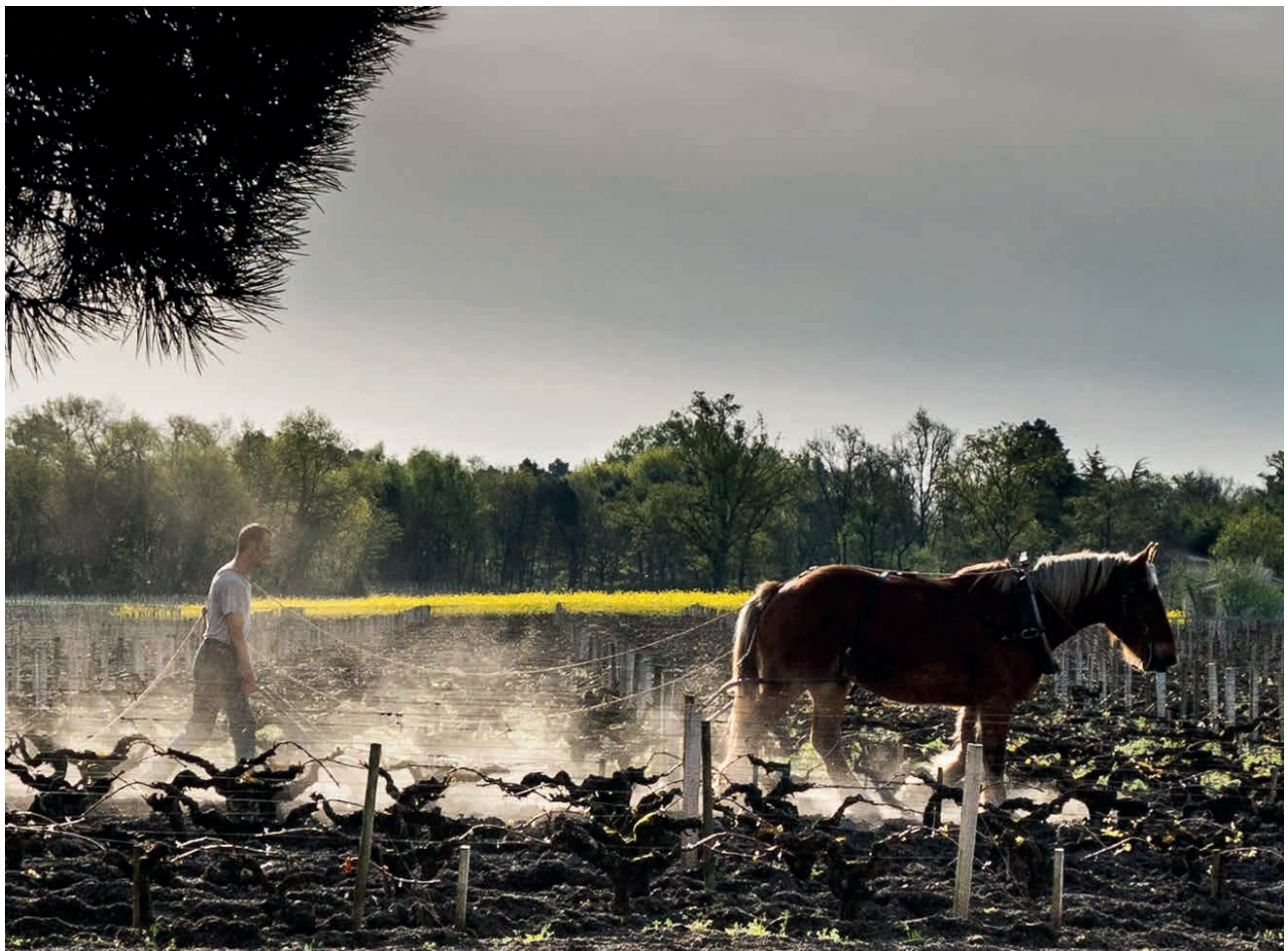
Top: Saint-Emilion in the afternoon. Bottom: horse at work at Domaine de Chevalier