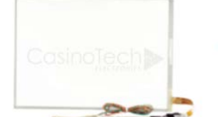
20.1" Sensor MicroTouch 17-9321-206 $200.00