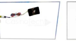
22.37" Sensor MicroTouch 17-9311-206 $210.00