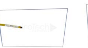
23.6" IGT TPK Touch Sensor $374.00