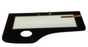
19.46" 3M Twinstar Panel Sensor $275.00