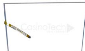
22.37" Sensor Konami, Bally, WMS $258.00