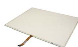
24.62" MicroTouch 17-9291-226 $275.00