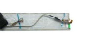
MicroTouch 17x3" Touch-screen IGT $138.42