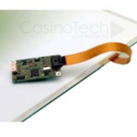
19.75" Screen MicroTouch w/Controller $155.00