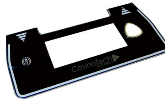
Mars X 14.2" Button Deck Sensor $1,380.00