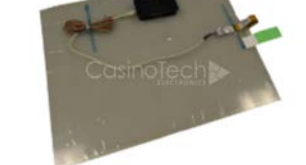
22" 3M Replacement Sensor $180.00