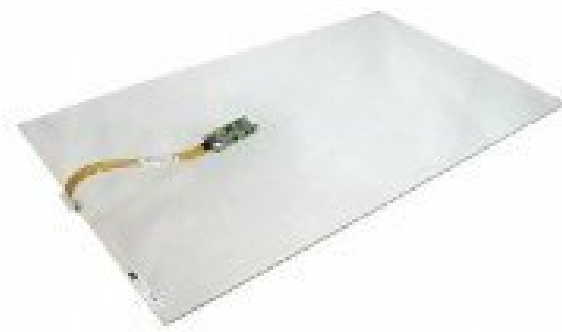
MicroTouch Sensor 27.23 98-003-4233-1 $350.00

The below sensors are in-stock and ready to ship. Offers are limited to quantity on-hand.