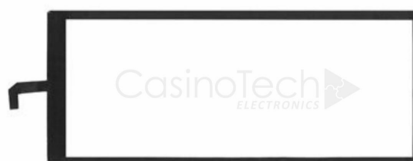
6.2" Hitachi Gasket Bally IView $4.50