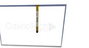
Ceronix 22" CPM2488 ATO Sensor $138.00