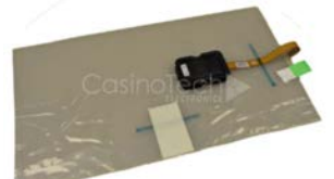
21.78" Sensor 98-0003-3807-3 $177.00