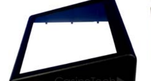
Ceronix 15" Touch Kit For Bar Top $150.00