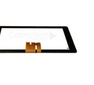
24" Tovis Monitor Touch Sensor $319.00