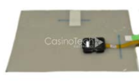
23.37" Sensor MicroTouch 17-9311-227 $270.00