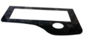
Twinstar I-Deck Touch Sensor $324.00