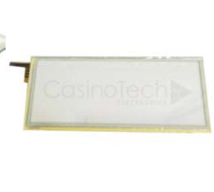
Kortek 6.2" IGT NexGen & Kortek $33.00