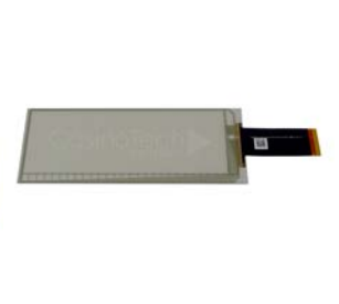
4.0 IView 6.2" PT Sensor $25.00