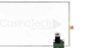
Bally 21.78 98-0003-3936-0 $195.00