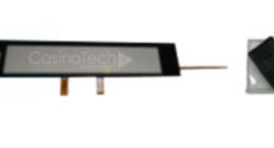
SciGames Jumbo Touch 3M Sensor $223.00