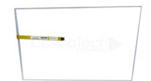
22.22" TPK Touch Sensor For IGT $215.00