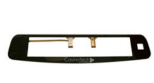
Bally Alpha I-Deck Sensor $275.00