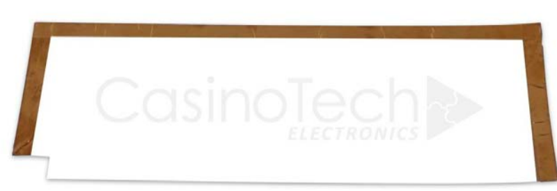
Mylar Touchscreen Cover 25-3725 $.80