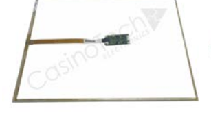
19" Konami & Ainsworth 3M Sensor $178.00