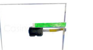
19" OEM Replacement 17-8891-226 $150.00