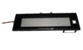
Bally S9 I-Deck Touch Sensor $223.00