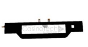
Bally Slant MicroTouch Sensor $223.00