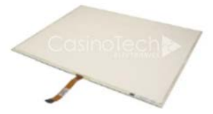
22.37" Sensor MicroTouch 17-9311-226 $230.00