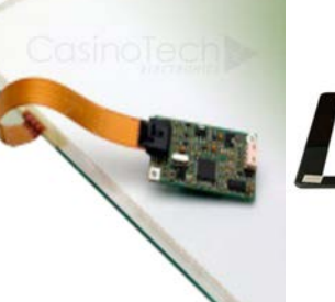
24.36" Sensor 98-0003-3875-0 $290.00