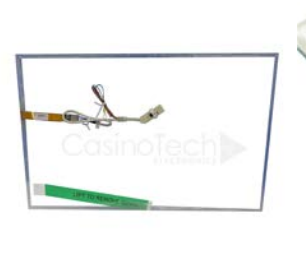
22.22" Sensor 98-1100-0004-3 $163.00