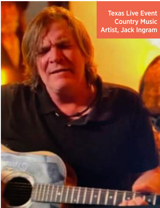
Texas Live Event Country Music Artist, Jack Ingram

We teamed up with Associa employees, Associa branches, and vendors to host events in both the virtual and in-person setting to ensure enough resources were raised to provide aid to families and organizations in need.