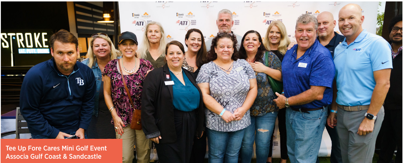
Tee Up Fore Cares Mini Golf Event Associa Gulf Coast & Sandcastle