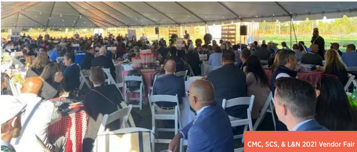
CMC, SCS, & L&N 2021 Vendor Fair