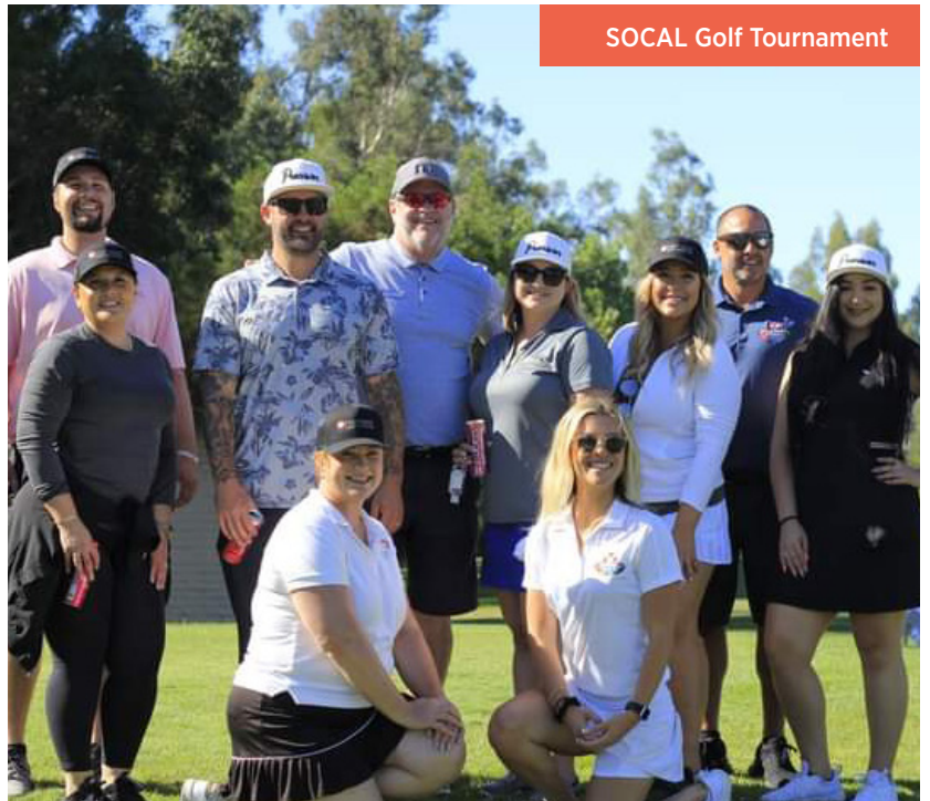
SOCAL Golf Tournament