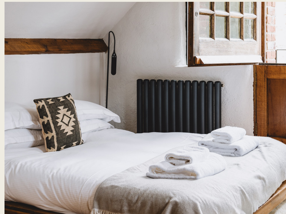
The Library Barn