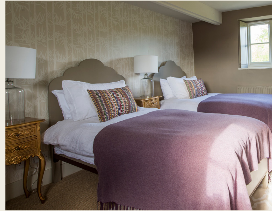
The Deer Cottage