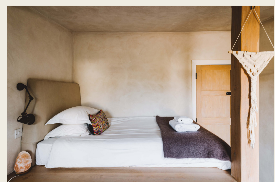
The Swallows Nest