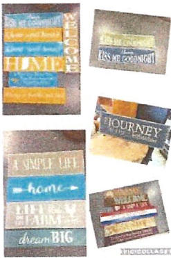
Rectangle - $15/each