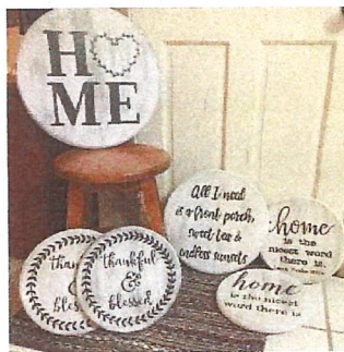
Round - $18/each

*Please note this is an adult only event. To be fair, we ask that only Hershey parents/guardians participate.