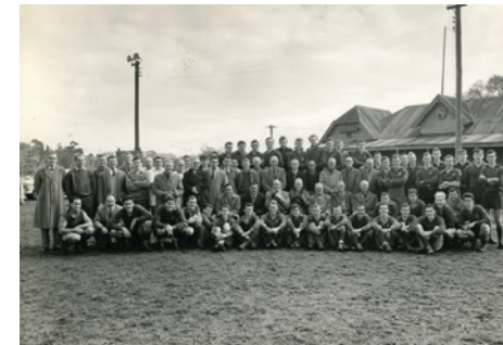
The Old Scotch Collegians' Football Club at Yarra Park in 1959