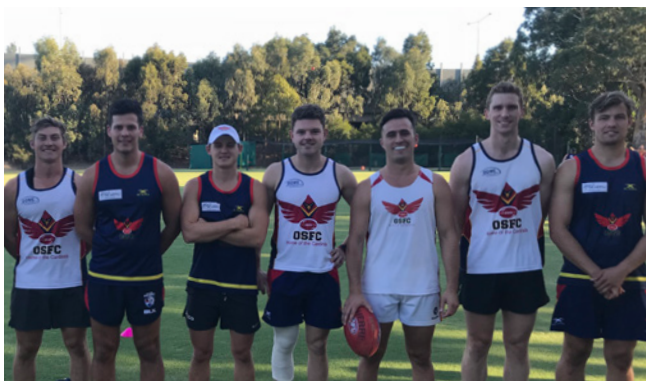
The 2018 OSFC Men's Leadership Group.