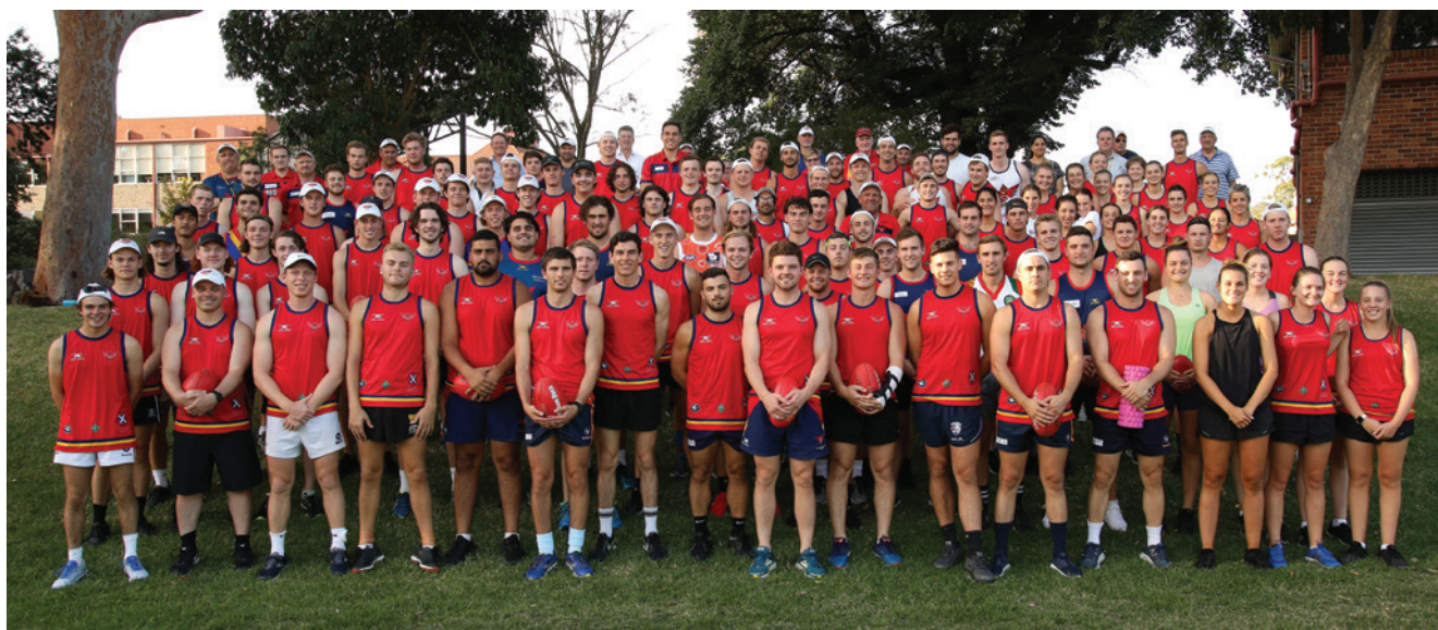
The Old Scottish Football Club at Preseason training 2019. Front cover L-R: The 1923 OSFC Premiership team and the 2018 OSFC Senior Men's team.