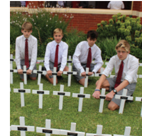
Club disbanded after round 9 of the 1940 season due to World War II