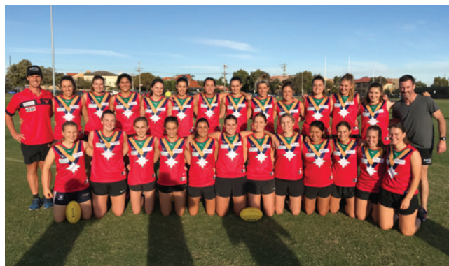
The Old Scotch Stars first official match V Old Brighton on 7 April 2018.