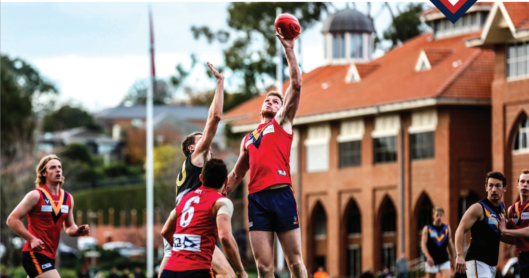
Old Scotch V Old Carey at Scotch College in June 2017.