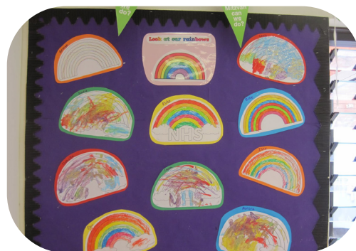
Rainbows for the NHS