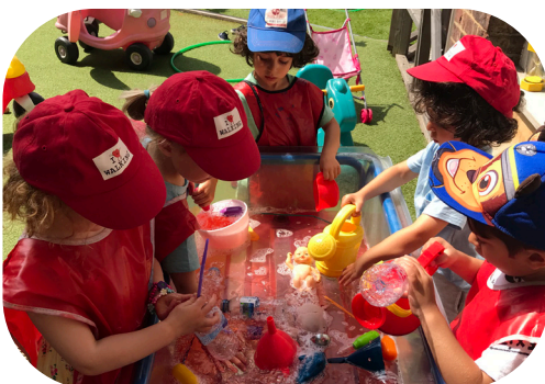
Wonderful activities at Brondesbury Park Synagogue Nursery