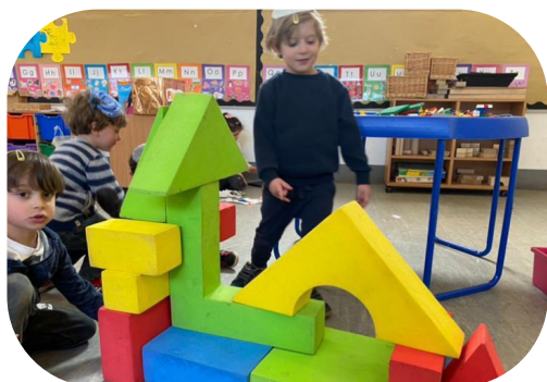
Enjoying learning through play at Woodside Gan

My children absolutely thrived at Woodside Gan. All the staff showed such care and interest in each of them. They really knew my children as individuals. Being part of Woodside Gan was being part of a community and my children left with a love of their Jewish identity, real friendships and a confidence that made them ready for school.