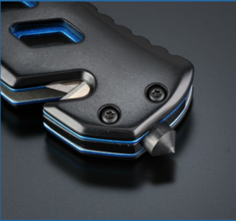
WINDOW BREAKER & BELT CUTTER