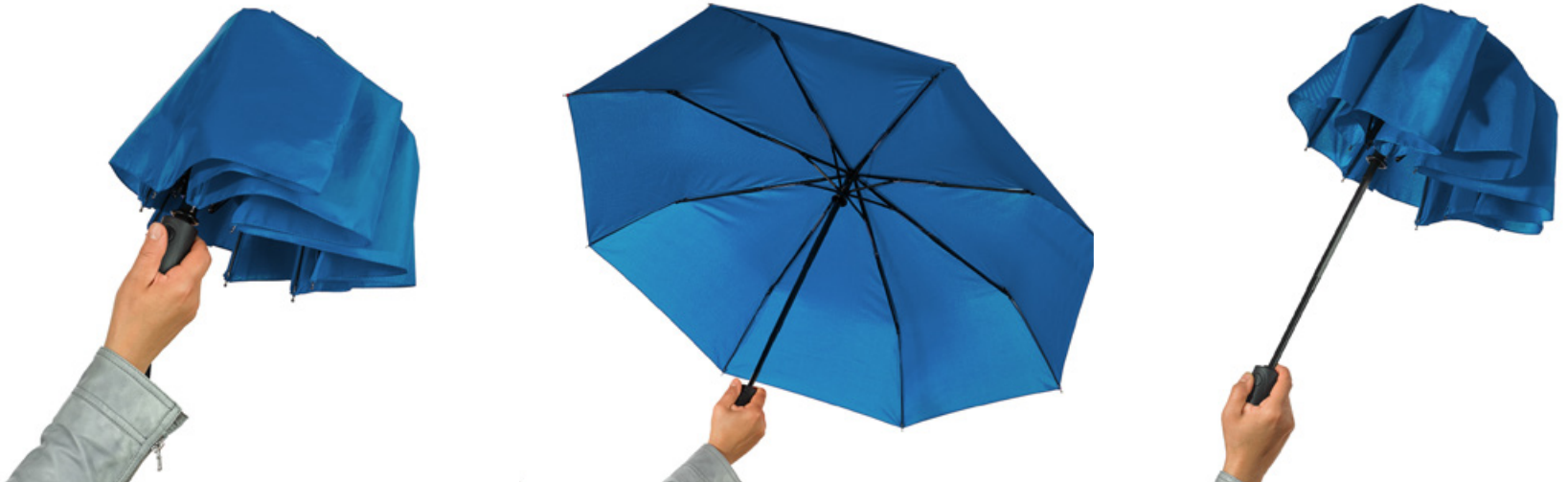
Step 1: press the button to open