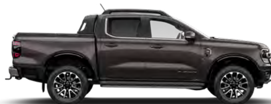
Equinox Bronze **