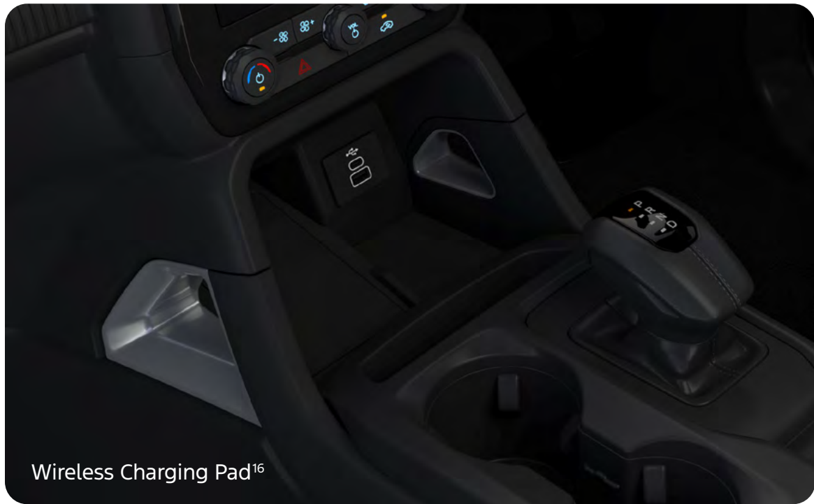
Wireless Charging Pad 16

On selected models, avoid the hassle of having to plug in your phone: simply place it on the Ranger's wireless charging pad and you're good to go.