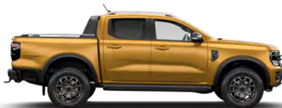
Luxe Yellow *~#