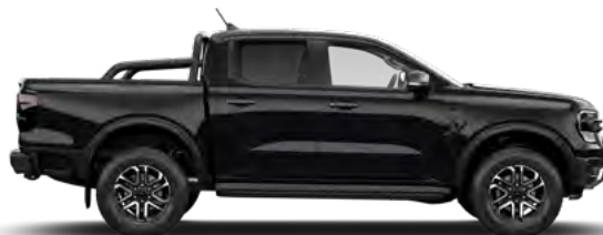
Shadow Black *