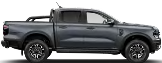
Meteor Grey *