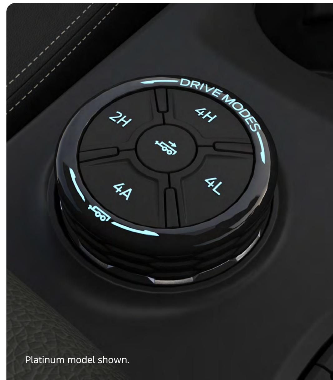
Platinum model shown.