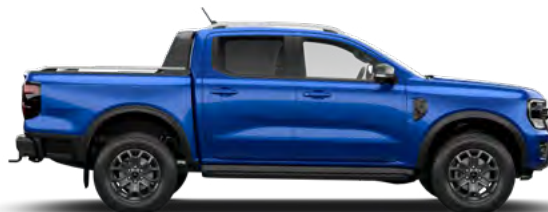
Blue Lightning *Δ