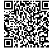
FIRST FIVE YEARS FUND