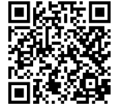
CHILD CARE AWARE