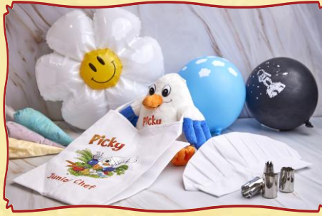
Junior Chef apron & hat