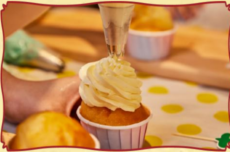
Selected pastry workshop