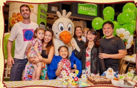
Picture opportunity with our Picky Mascot