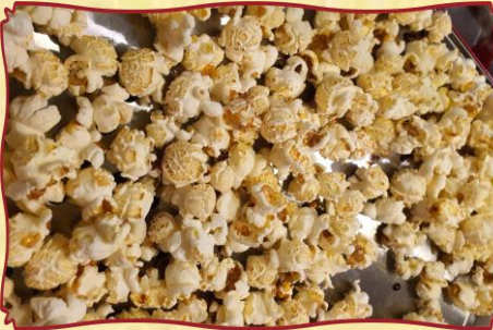
Live popcorn station