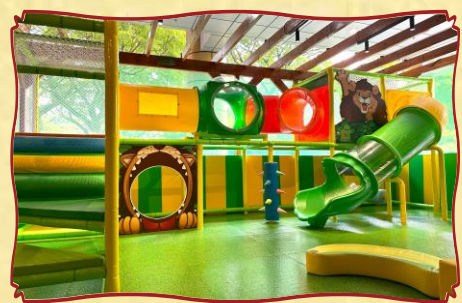
Access to fun-filled playground