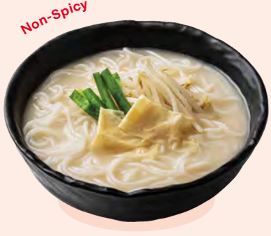
Vegetarian TamJai Broth 素清汤