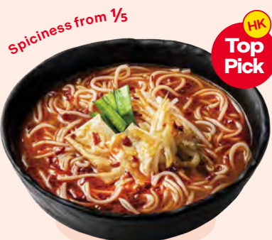
Chongqing Inspired Sour & Spicy Soup 重庆酸辣汤