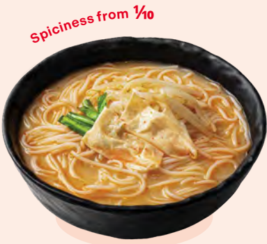
Numbing & Spicy Mala Soup 麻辣汤