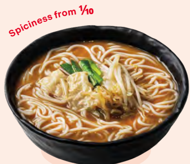
Signature Charred Pepper & Spices Soup 糊辣汤