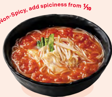
Tangy Tomato Soup 番茄浓汤