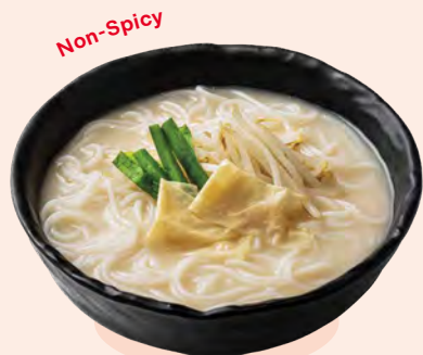
TamJai Broth 清汤

All Mixian come with Bean Sprouts, Beancurd Sheets and Chinese Chives. 所有米线附有芽菜、腐皮及韭菜