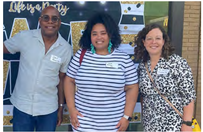
Charlotte People of Color Network Event, 2022