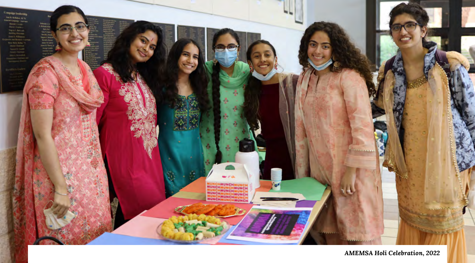
AMEMSA Holi Celebration, 2022