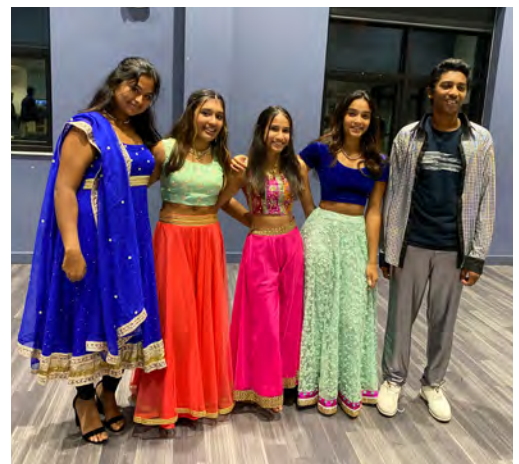
Diwali Celebration, 2021